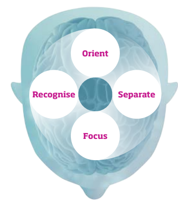
For the full story about Oticon BrainHearing technology we refer you to www.oticon.com/BrainHearing.

Adding to this your clients will also benefit from BrainHearing technology. By supporting the way the brain makes sense of sound Plus Power will provide your clients with better hearing, supporting them in their ability to engage in conversations with family and friends.